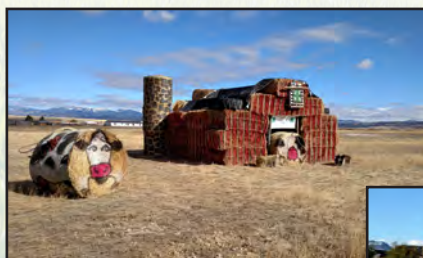
Above: The First Place Winner in Lewis & Clark Farm Bureau Bale Contest was Last Chance Livestock - Gathering Cattle at the Barn.