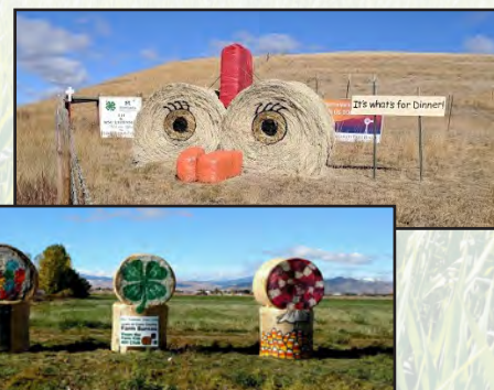
Top: Second place winner was Montana City Mavericks - It's What's For Dinner - Chicken. Third place went to the Farm Kids 4-H Club - Candy.