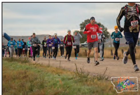
Hoofin' it for Hunger at Fort Keogh in Miles City.