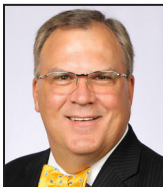
Photo Contest Winner Announced

Sponsored by: Mountain West Farm Bureau Mutual Insurance Company